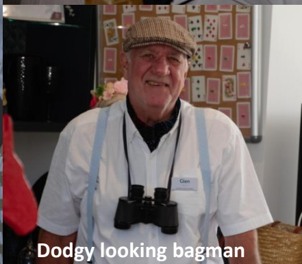
Dodgy looking bagman