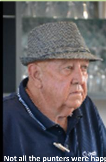
Not all the punters were happy!