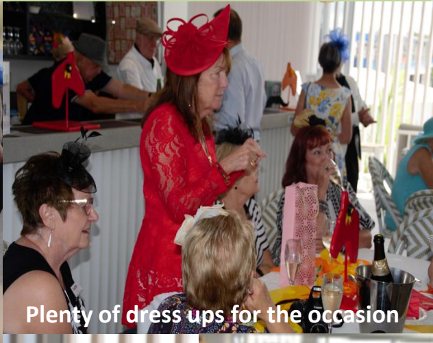
Plenty of dress ups for the occasion